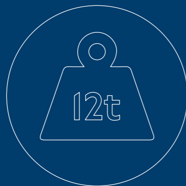
Table 2 shows vehicle types that are only partially exempt from specific elements of the HGV safety permit scheme. These vehicles must still hold a valid permit. Where the following vehicle type is rated zero star and therefore required to fit a Safe System of mitigating measures, they are exempt from the listed equipment only.